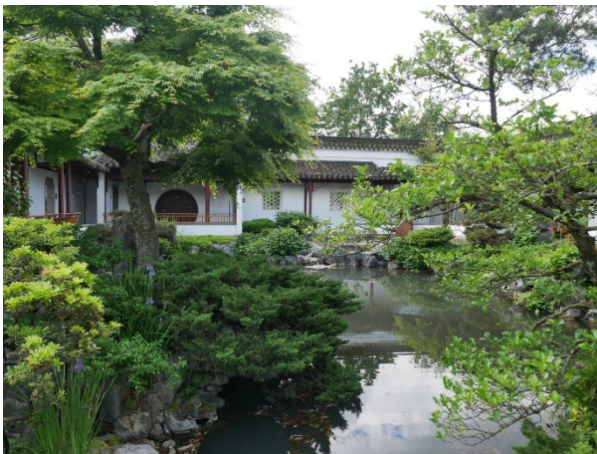
Photo: Dr. Sun Yat-Sen, Classical Chinese Garden